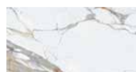
Calacatta Bronzo 80x160 cm F86ACDAOYRO Lappato Matt F86ACDAOLRO Full Lappato