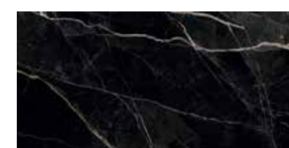
Calacatta Nero 120x240 cm F14ACDKOYRO Lappato Matt F14ACDKOLRO Full Lappato