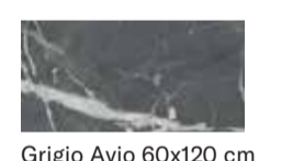
Grigio Avio 60x120 cm F62ACDGOYRO Lappato Matt F62ACDGOLRO Full Lappato