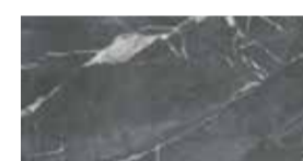
Grigio Avio 80x160 cm F86ACDGOYRO Lappato Matt F86ACDGOLRO Full Lappato