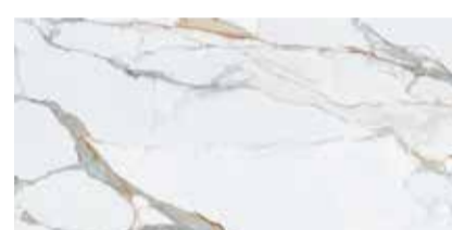
Calacatta Bronzo 120x240 cm F14ACDAOYRO Lappato Matt F14ACDAOLRO Full Lappato

120x240 cm | 80x160 cm | 120x120 cm | 60x120 cm