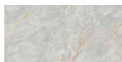
Onice Aria Beige 120x240 cm F14ACDBOYRO Lappato Matt F14ACDBOLRO Full Lappato