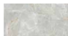
Onice Aria Beige 80x160 cm F86ACDBOYRO Lappato Matt F86ACDBOLRO Full Lappato