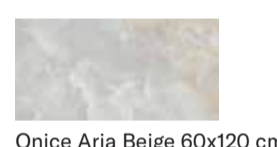
Onice Aria Beige 60x120 cm F62ACDBOYRO Lappato Matt F62ACDBOLRO Full Lappato