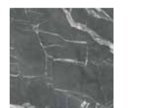
Grigio Avio 120x120 cm F12ACDGOYRO Lappato Matt F12ACDGOLRO Full Lappato