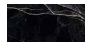
Calacatta Nero 80x160 cm F86ACDKOYRO Lappato Matt F86ACDKOLRO Full Lappato