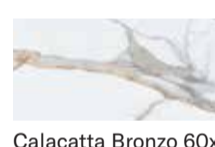
Calacatta Bronzo 60x120 cm F62ACDAOYRO Lappato Matt F62ACDAOLRO Full Lappato