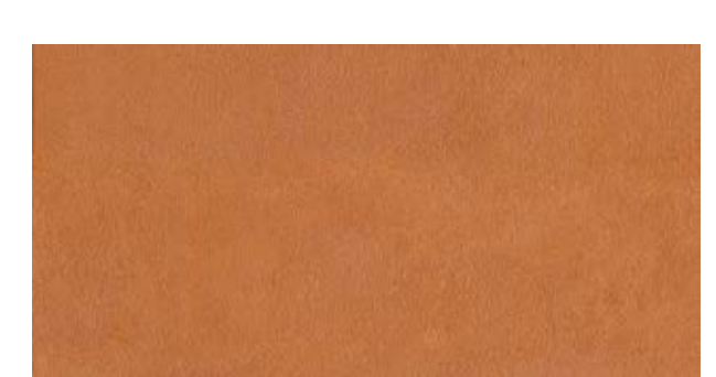
Terracotta Chiaro 60x120 cm F62TERCONRO

for a modern, versatile, and modular design.