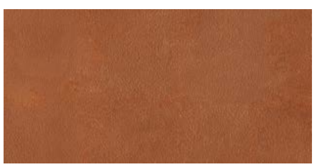
Terracotta Scuro 60x120 cm F62TERC2NRO