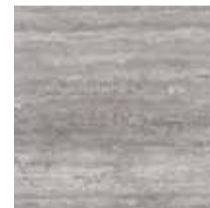
Veincut Silver Grey 120x120 cm F12TRTGOYRO Lappato Matt F12TRTGOLRO Full Lappato