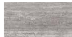
Veincut Silver Grey 80x160 cm F86TRTGOYRO Lappato Matt F86TRTGOLRO Full Lappato