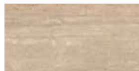
Veincut Beige 80x160 cm F86TRTBOYRO Lappato Matt F86TRTBOLRO Full Lappato