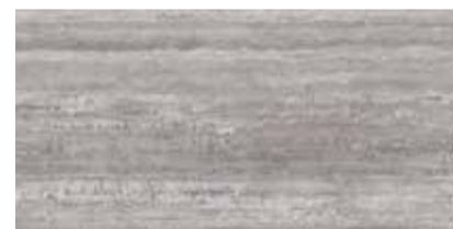
Veincut Silver Grey 120x240 cm F14TRTGOYRO Lappato Matt F14TRTGOLRO Full Lappato