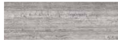
Veincut Silver Grey 80x240 cm F84TRTGOYRO Lappato Matt F84TRTGOLRO Full Lappato