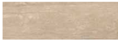
Veincut Beige 80x240 cm F84TRTBOYRO Lappato Matt F84TRTBOLRO Full Lappato

120x240 cm | 80x240 cm | 80x160 cm 120x120 cm | 60x120 cm