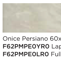
Onice Persiano 60x120 cm F62PMPEOYRO Lappato Matt F62PMPEOLRO Full Lappato