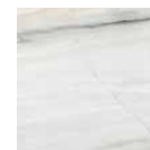
Bianco Lasa 120x120 cm F12PMNAOYRO Lappato Matt F12PMNAOLRO Full Lappato