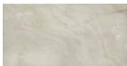
Onice Persiano 120x240 cm F14PMPEOYRO Lappato Matt F14PMPEOLRO Full Lappato

120x240 cm | 80x160 cm 120x120 cm | 60x120 cm