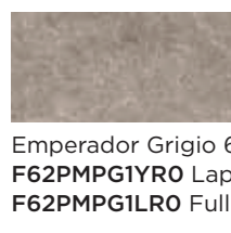
Emperador Grigio 60x120 cm F62PMPGIYRO Lappato Matt F62PMPGILRO Full Lappato