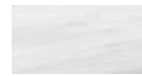
Bianco Lasa 80x160 cm F86PMNAOYRO Lappato Matt F86PMNAOLRO Full Lappato

4 Sizes to exploit all architectural and creative potential.