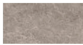
Emperador Grigio 80x160 cm F86PMNGIYRO Lappato Matt F86PMNGILRO Full Lappato