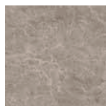
Emperador Grigio 120x120 cm F12PMNGIYRO Lappato Matt F12PMNGILRO Full Lappato