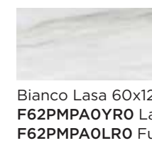
Bianco Lasa 60x120 cm F62PMPAOYRO Lappato Matt F62PMPAOLRO Full Lappato