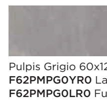
Pulpis Grigio 60x120 cm F62PMPGOYRO Lappato Matt F62PMPGOLRO Full Lappato