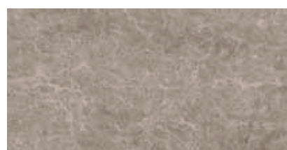
Emperador Grigio 120x240 cm F14PMPGIYRO Lappato Matt F14PMPGILRO Full Lappato