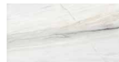
Bianco Lasa 120x240 cm F14PMPAOYRO Lappato Matt F14PMPAOLRO Full Lappato