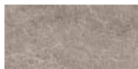
Emperador Grigio 80x160 cm F86PMNGIYRO Lappato Matt F86PMNGILRO Full Lappato