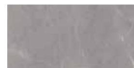
Pulpis Grigio 80x160 cm F86PMNGOYRO Lappato Matt F86PMNGOLRO Full Lappato