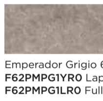
Emperador Grigio 60x120 cm F62PMPGIYRO Lappato Matt F62PMPGILRO Full Lappato