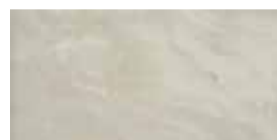
Onice Persiano 80x160 cm F86PMNEOYRO Lappato Matt F86PMNEOLRO Full Lappato

120x240 cm | 80x160 cm 120x120 cm | 60x120 cm