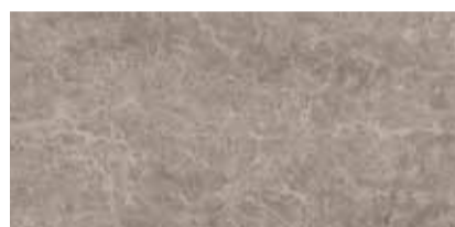
Emperador Grigio 120x240 cm F14PMPGIYRO Lappato Matt F14PMPGILRO Full Lappato