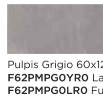
Pulpis Grigio 60x120 cm F62PMPGOYRO Lappato Matt F62PMPGOLRO Full Lappato