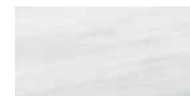
Bianco Lasa 80x160 cm F86PMNAOYRO Lappato Matt F86PMNAOLRO Full Lappato