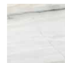
Bianco Lasa 120x120 cm F12PMNAOYRO Lappato Matt F12PMNAOLRO Full Lappato