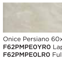
Onice Persiano 60x120 cm F62PMPEOYRO Lappato Matt F62PMPEOLRO Full Lappato