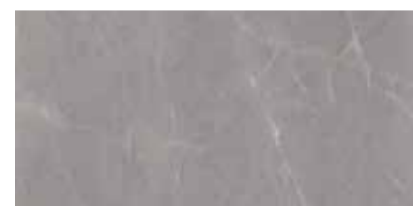
Pulpis Grigio 120x240 cm F14PMPGOYRO Lappato Matt F14PMPGOLRO Full Lappato