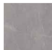
Pulpis Grigio 120x120 cm F12PMPGOYRO Lappato Matt F12PMPGOLRO Full Lappato