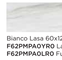
Bianco Lasa 60x120 cm F62PMPAOYRO Lappato Matt F62PMPAOLRO Full Lappato