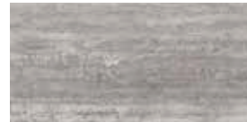
Veincut Silver Grey 80x160 cm F86TRTGOYRO Lappato Matt F86TRTGOLRO Full Lappato

4 Sizes to exploit all architectural and creative potential.