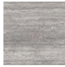
Veincut Silver Grey 120x120 cm F12TRTGOYRO Lappato Matt F12TRTGOLRO Full Lappato