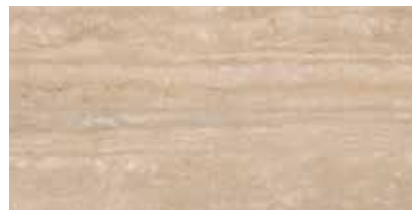
Veincut Beige 120x240 cm F14TRTBOYRO Lappato Matt F14TRTBOLRO Full Lappato

120x240 cm | 80x160 cm | 120x120 cm 60x120 cm