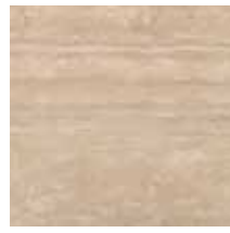
Veincut Beige 120x120 cm F12TRTBOYRO Lappato Matt F12TRTBOLRO Full Lappato