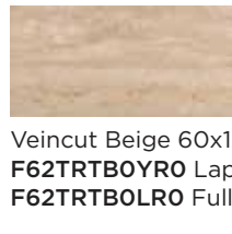
Veincut Beige 60x120 cm F62TRTBOYRO Lappato Matt F62TRTBOLRO Full Lappato