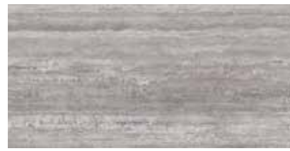
Veincut Silver Grey 120x240 cm F14TRTGOYRO Lappato Matt F14TRTGOLRO Full Lappato