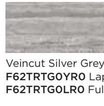
Veincut Silver Grey 60x120 cm F62TRTGOYRO Lappato Matt F62TRTGOLRO Full Lappato