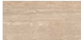
Veincut Beige 80x160 cm F86TRTBOYRO Lappato Matt F86TRTBOLRO Full Lappato

2 Inspirations interpretation of marble, in an elegant and suggestive tones.