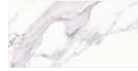
Michelangelo 80x160 cm F86LPTAOYRO Lappato Matt F86LPTAOLRO Full Lappato