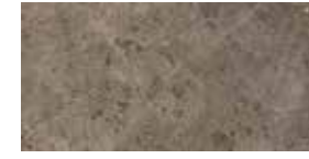
Grigio Terra 80x160 cm F86LPTGOYRO Lappato Matt F86LPTGOLRO Full Lappato

5 Sizes to exploit all architectural and creative potential.