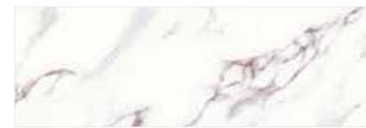
Michelangelo 80x240 cm F84LPTAOYRO Lappato Matt F84LPTAOLRO Full Lappato