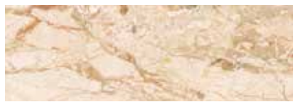
Breccia Aurora 80x240 cm F84LPTBOYRO Lappato Matt F84LPTBOLRO Full Lappato

120x240 cm | 80x240 cm | 80x160 cm 120x120 cm | 60x120 cm