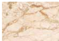
Breccia Aurora 120x120 cm F12LPTBOYRO Lappato Matt F12LPTBOLRO Full Lappato