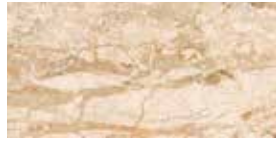
Breccia Aurora 80x160 cm F86LPTBOYRO Lappato Matt F86LPTBOLRO Full Lappato

4 Inspirations varieties of marble in different elegant and suggestive tones.