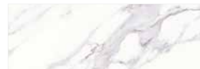
Michelangelo 120x240 cm F14LPTAOYRO Lappato Matt F14LPTAOLRO Full Lappato