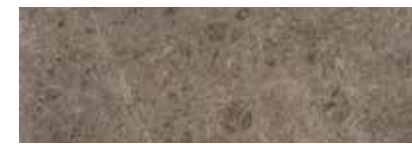
Grigio Terra 80x240 cm F84LPTGOYRO Lappato Matt F84LPTGOLRO Full Lappato