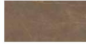
Amani Bronze 80x160 cm F86LPTFOYRO Lappato Matt F86LPTFOLRO Full Lappato