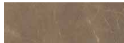
Amani Bronze 120x240 cm F14LPTFOYRO Lappato Matt F14LPTFOLRO Full Lappato