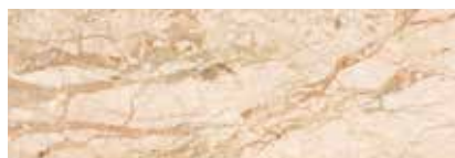
Breccia Aurora 120x240 cm F14LPTBOYRO Lappato Matt F14LPTBOLRO Full Lappato