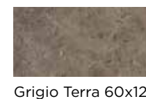
Grigio Terra 60x120 cm F62LPTGOYRO Lappato Matt F62LPTGOLRO Full Lappato