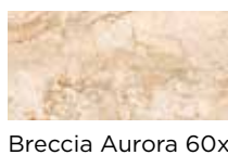
Breccia Aurora 60x120 cm F62LPTBOYRO Lappato Matt F62LPTBOLRO Full Lappato