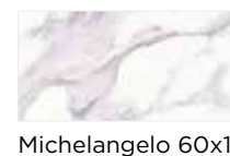
Michelangelo 60x120 cm F62LPTAOYRO Lappato Matt F62LPTAOLRO Full Lappato