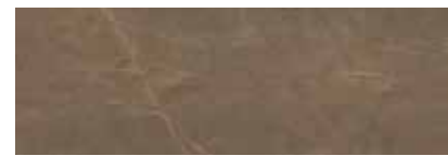
Amani Bronze 80x240 cm F84LPTFOYRO Lappato Matt F84LPTFOLRO Full Lappato