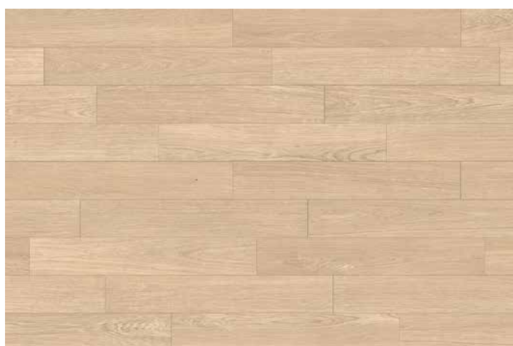
20x120 cm F22ESXBONRO Rovere Chiaro