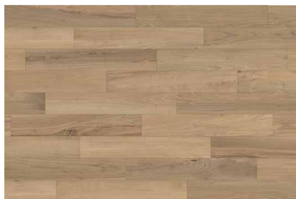
20x120 cm F22ESXFONRO Noce

Full body-colored porcelain stoneware (international standard) | Vitrified stoneware (indian standard). Rectified | 9 mm thickness