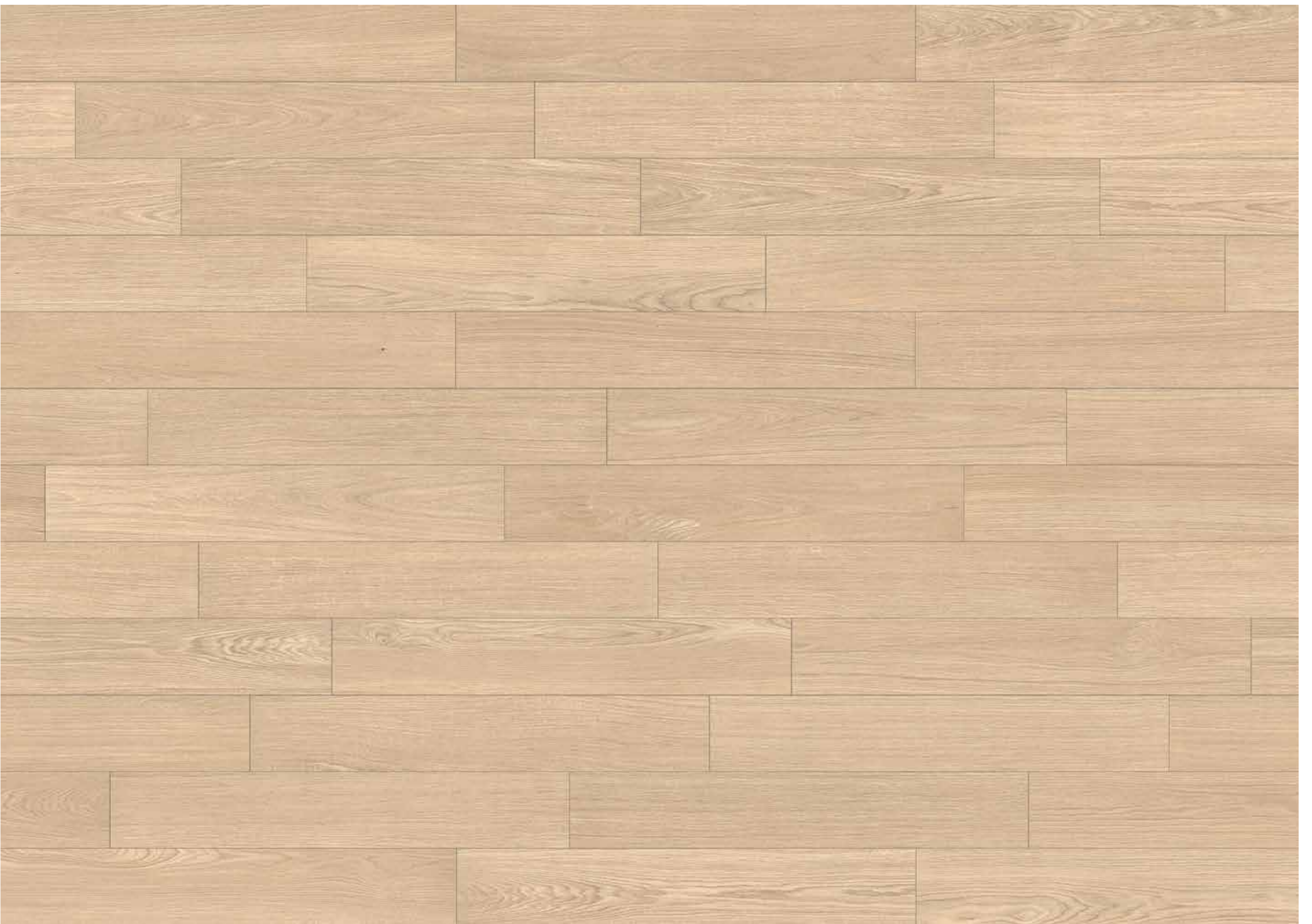
ROVERE CHIARO available also in Rovere Tortora