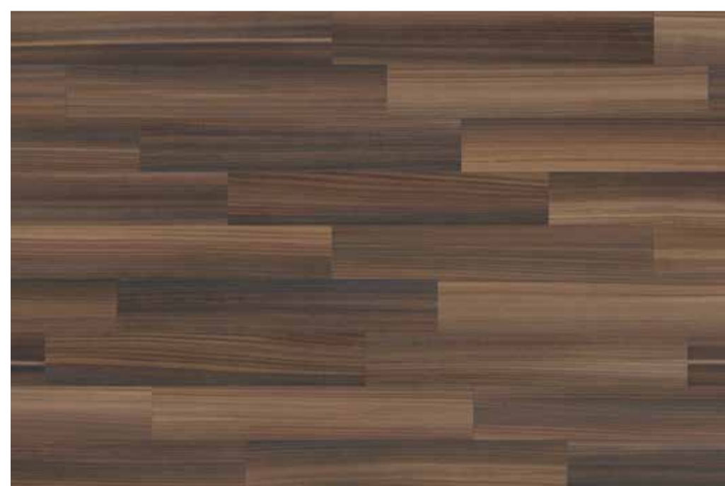
20x120 cm F22ESXFINRO Eucalipto