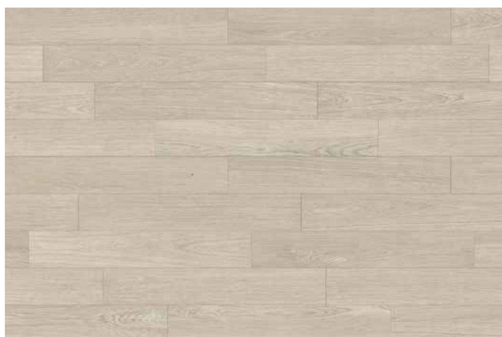
20x120 cm F22ESXGINRO Rovere Tortora