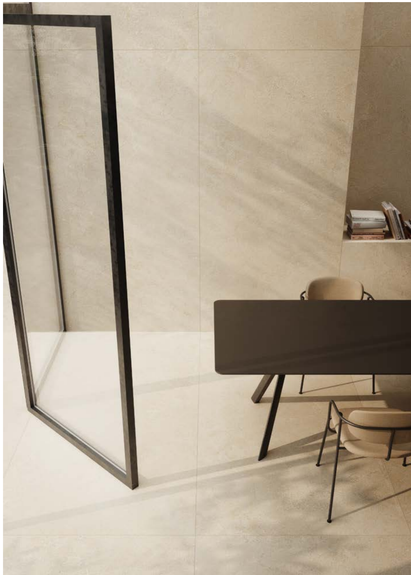
Wall | Floor: Lithic Roccia Portoghese 120x240 cm