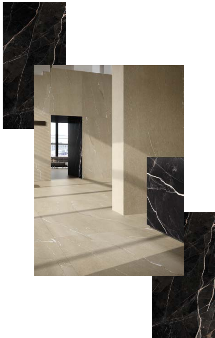
Wall | Floor: Lithic Pannonia 120x240 cm Desk: Calacatta Nero Lappato Matt 120x240 cm