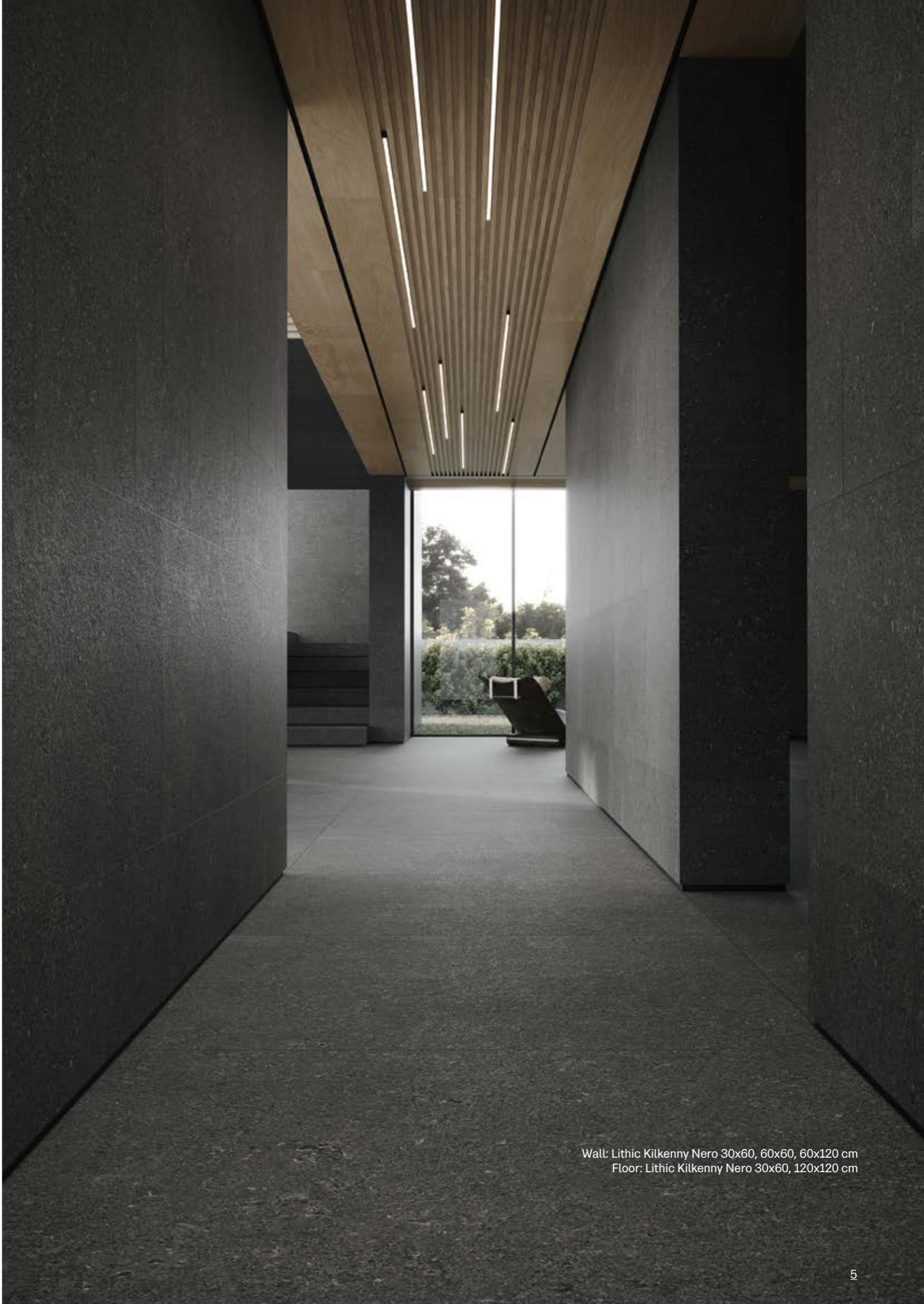
Wall: Lithic Kilkeny Nero 30x60, 60x60, 60x120 cm Floor: Lithic Kilkeny Nero 30x60, 120x120 cm

The Absolute Matte surface enhances the design of Nexion sintered stone, offering an unparalleled soft-touch experience without compromising on anti-slip and anti-reflective performance.