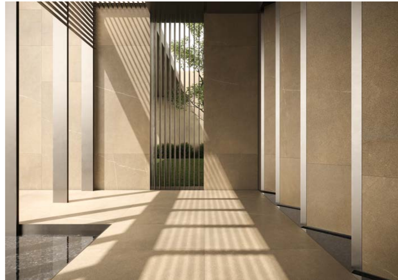
Wall: Lithic Pietra Piasentina 120x240 cm Floor: Lithic Pietra Piasentina 120x120 cm