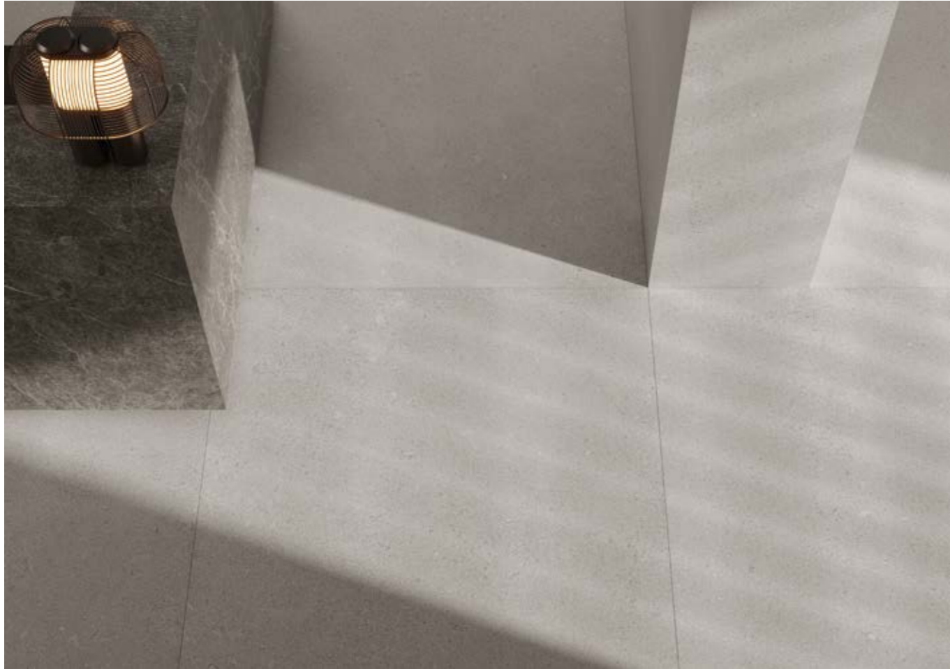
Wall: Lithic Basalto Grigio 120x240 cm Floor: Lithic Basalto Grigio 120x120 cm Reception desk: Lithic Gabbro Sfumato 120x240 cm