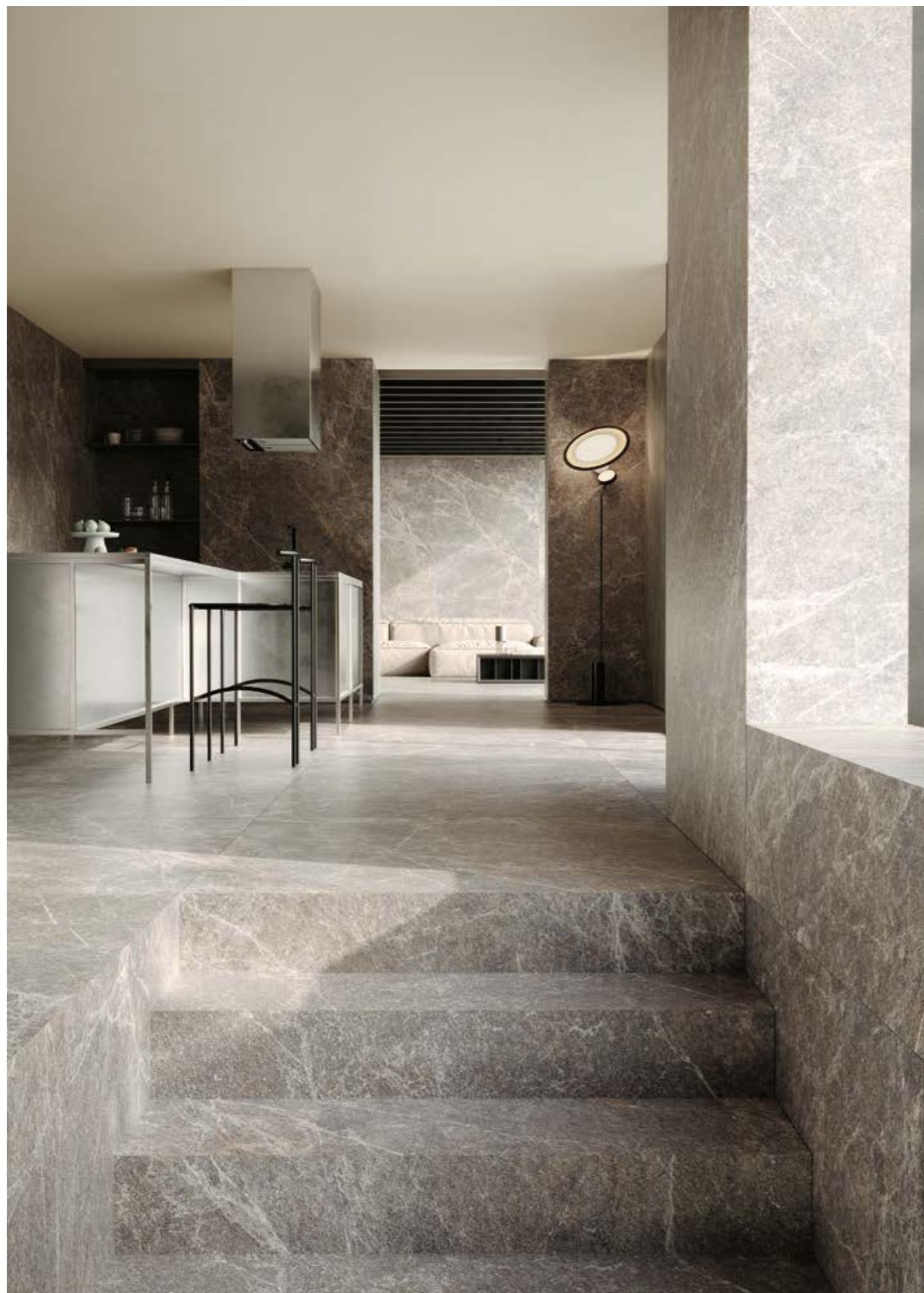
Wall: Lithic Gabbro Sfumato 120x240 cm Floor: Lithic Gabbro Sfumato 120x120 cm