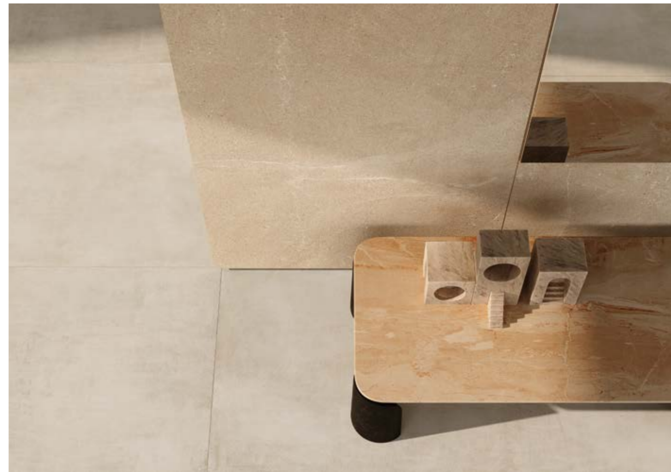
Wall: Lithic Vicenza Beige 120x240 cm Floor: Terraelino Calce 120x120 cm