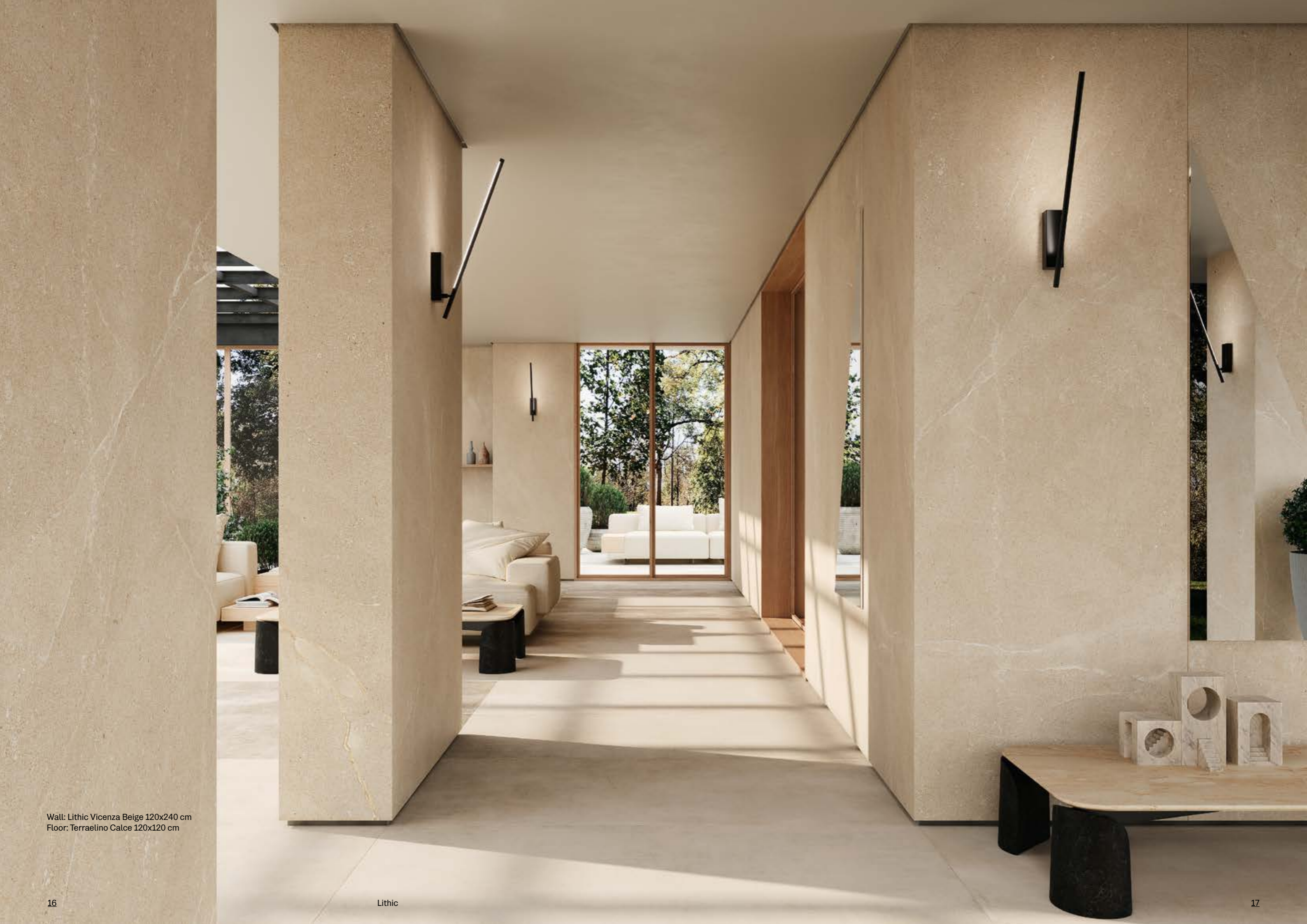
Wall: Lithic Vicenza Beige 120x240 cm Floor: Terraelino Calce 120x120 cm