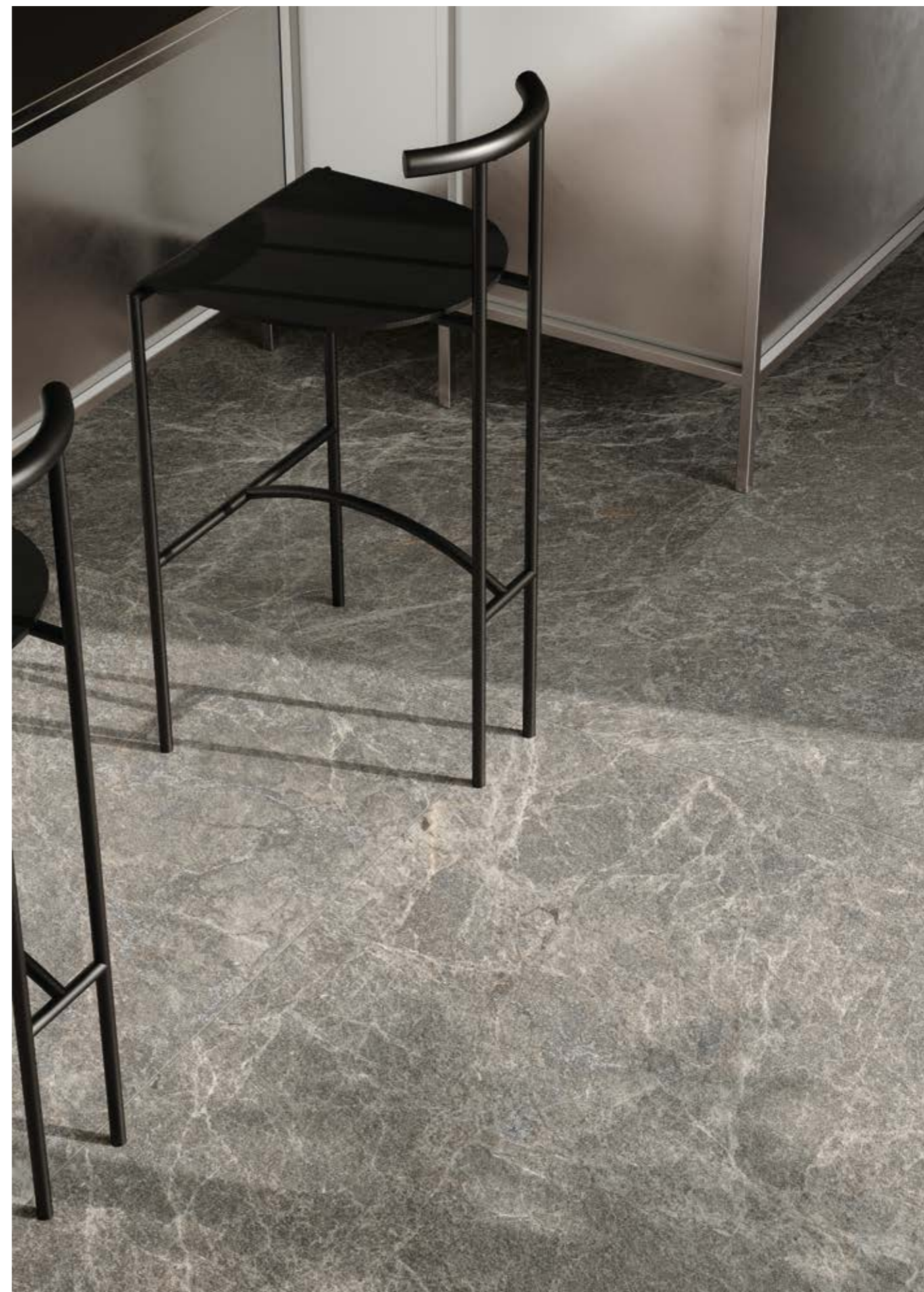
Floor: Lithic Gabbro Sfumato 120x120 cm